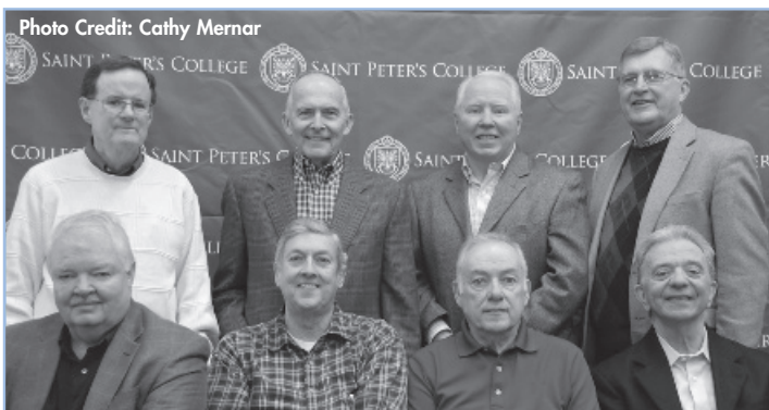
Members of the Class of 1961 were special guests at the Peacock Nation Reception on February 13. This was one of the events leading up to their 50 th reunion.